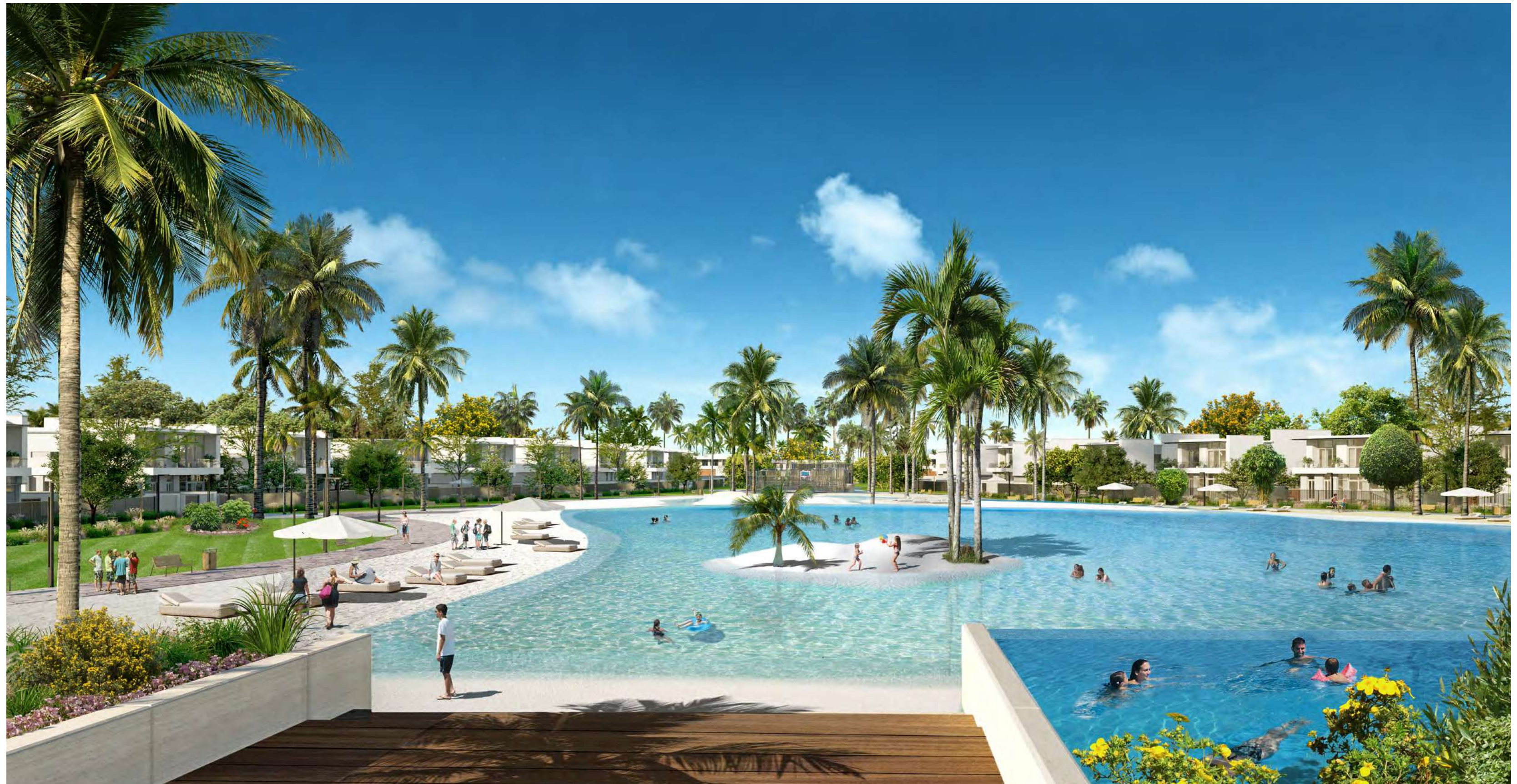
ARTIST RENDERING FOR ILLUSTRATIVE PURPOSES ONLY.