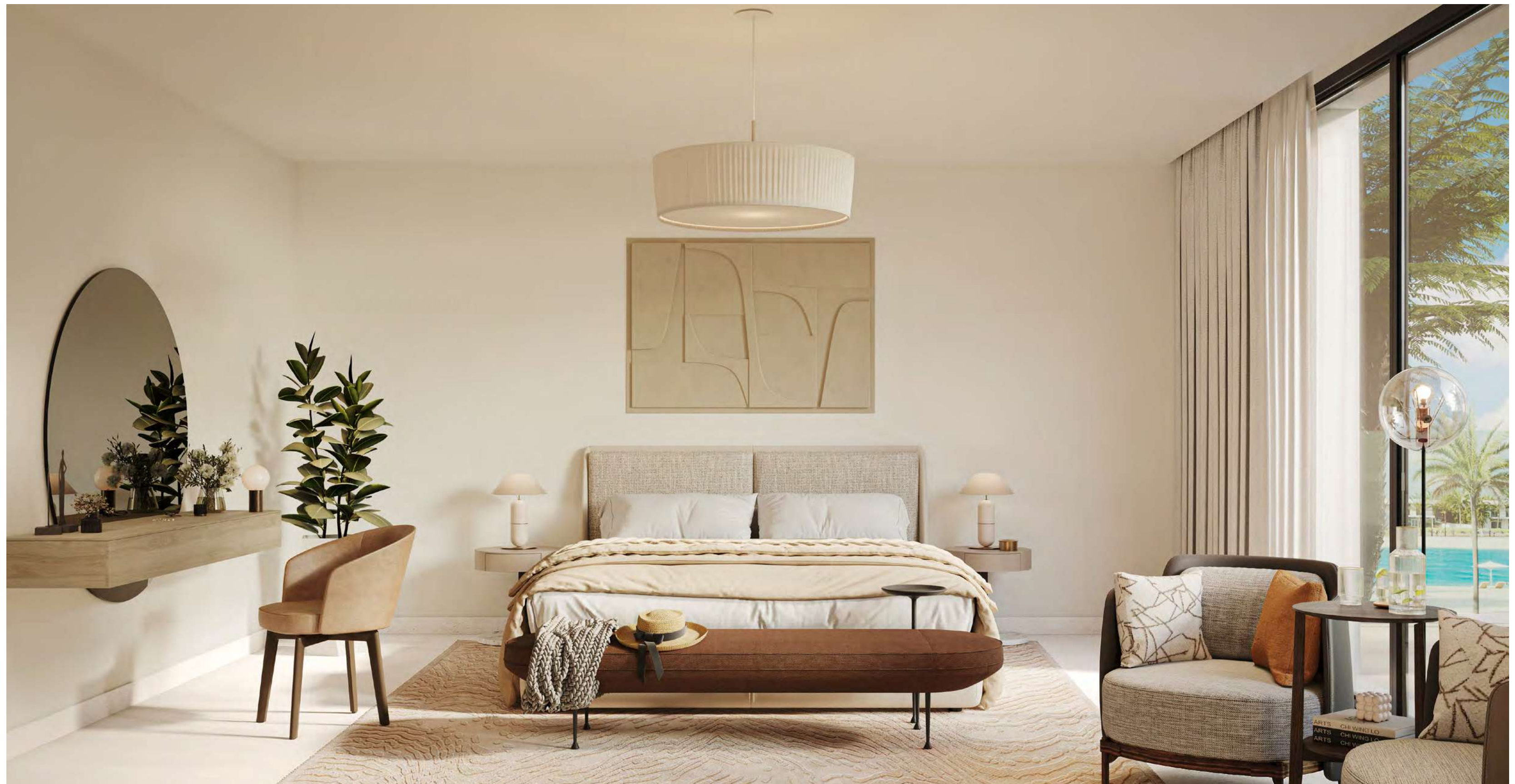
ARTIST RENDERING FOR ILLUSTRATIVE PURPOSES ONLY.