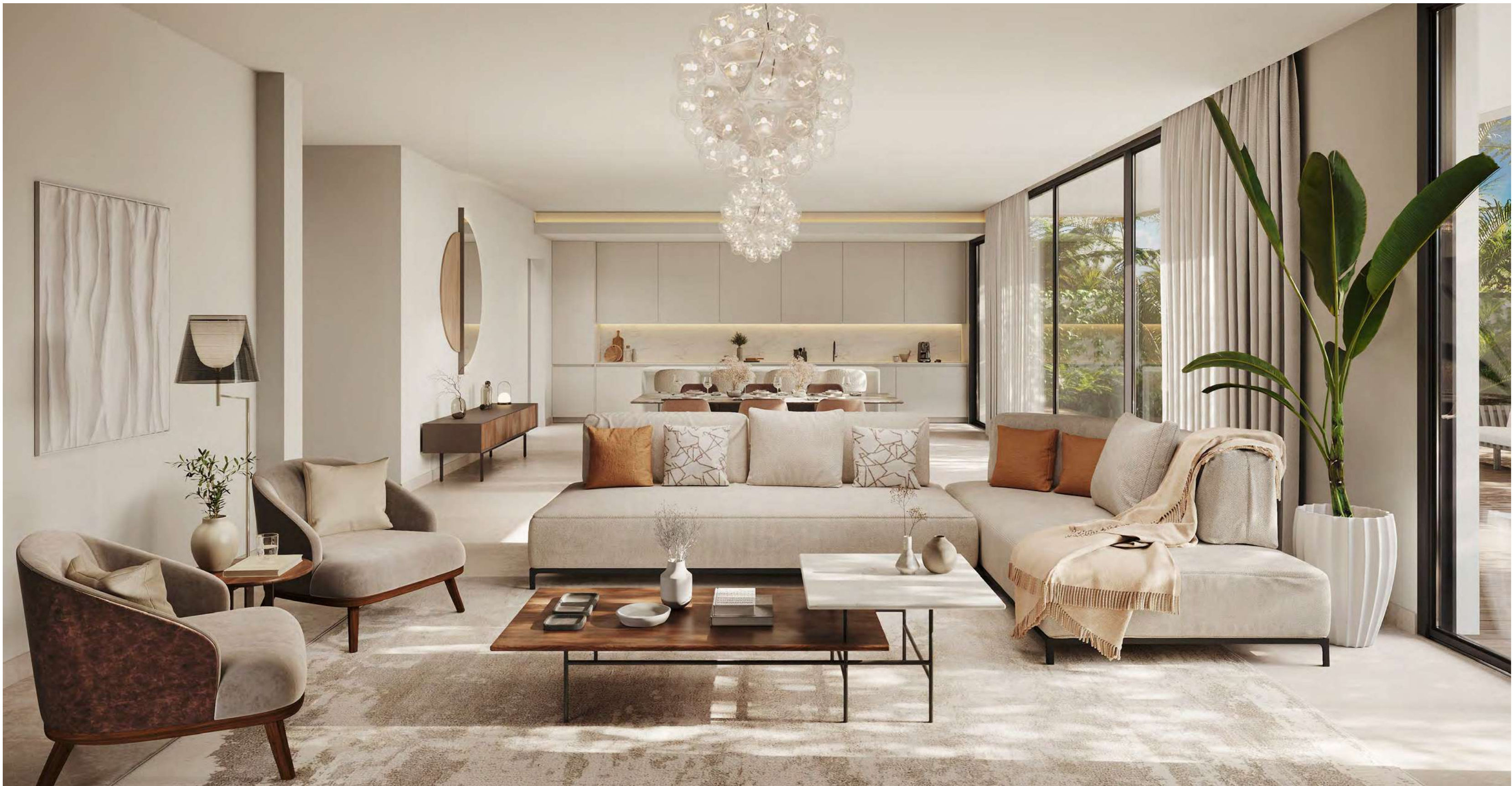
ARTIST RENDERING FOR ILLUSTRATIVE PURPOSES ONLY.