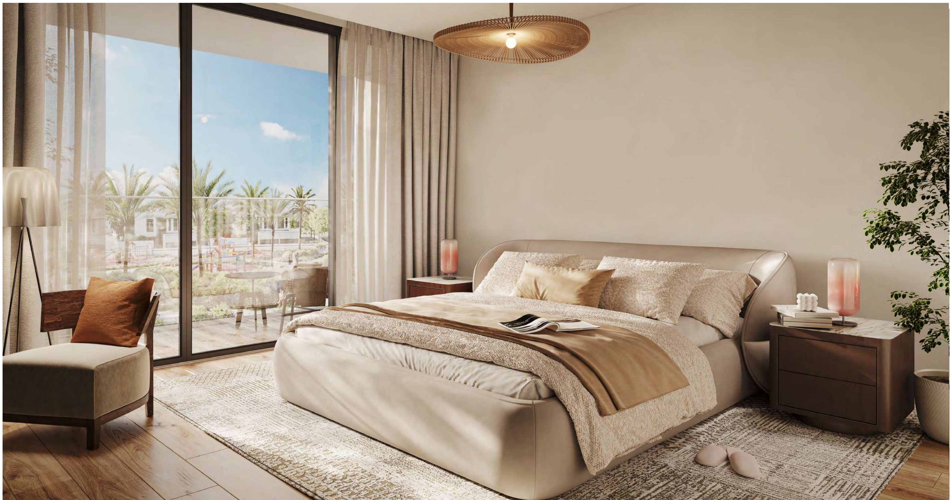
ARTIST RENDERING FOR ILLUSTRATIVE PURPOSES ONLY.