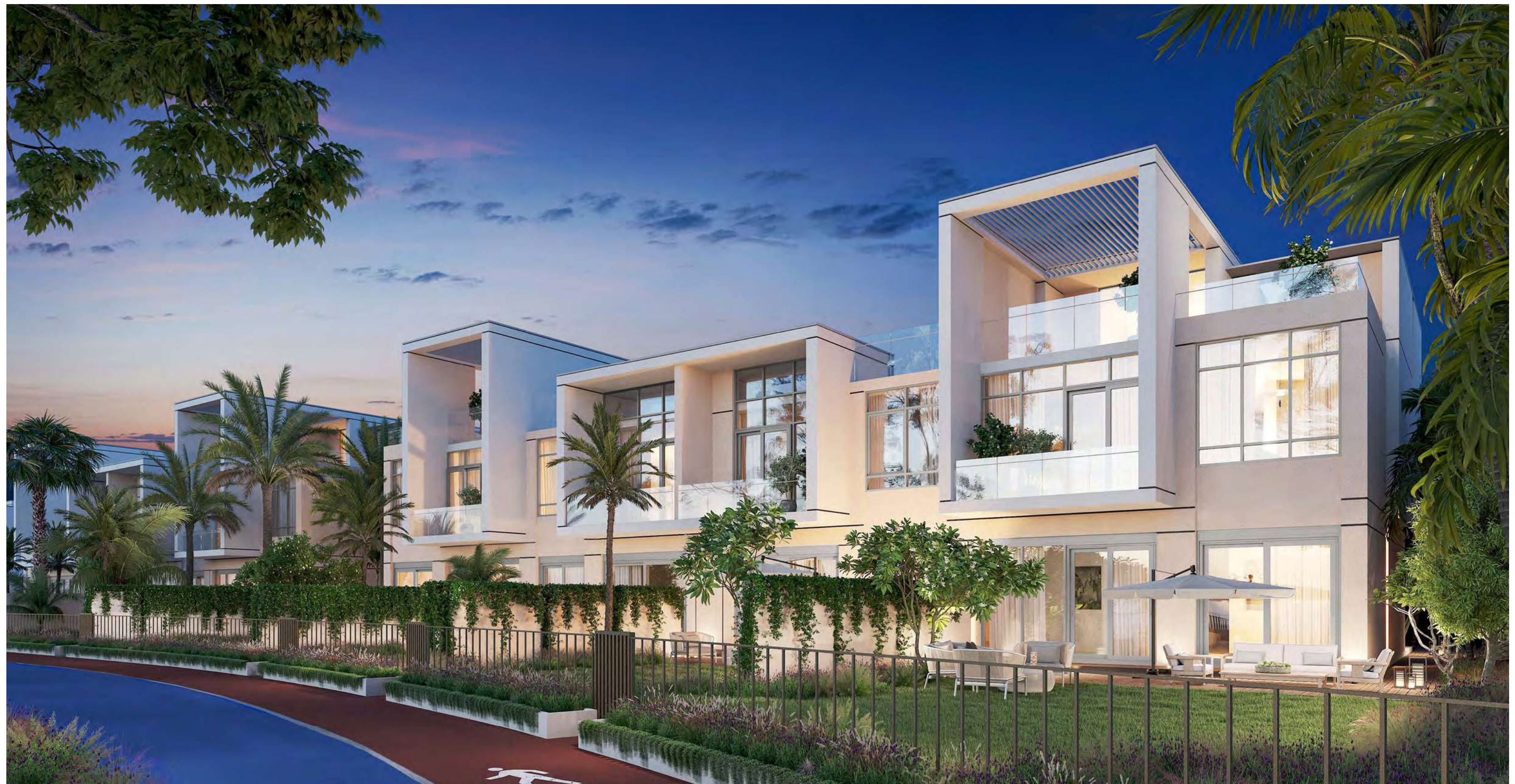
ARTIST RENDERING FOR ILLUSTRATIVE PURPOSES ONLY.