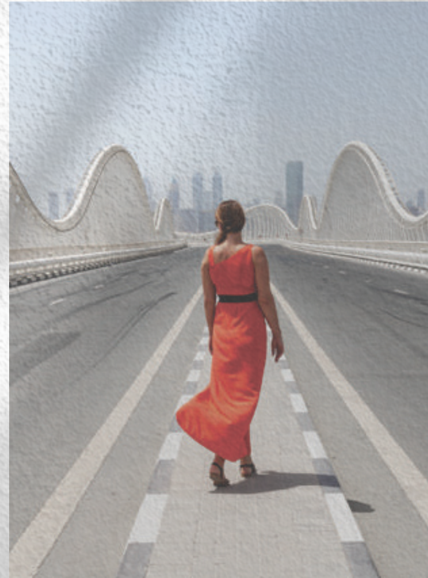
Exterior Community View

Together, the glass facade and layered terraces give the building a unique identity, setting a new standard for architecture in this exclusive area.